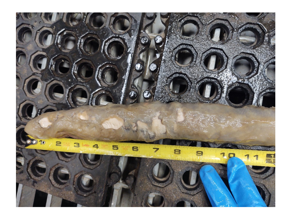
Sincerely, Project Fisheries